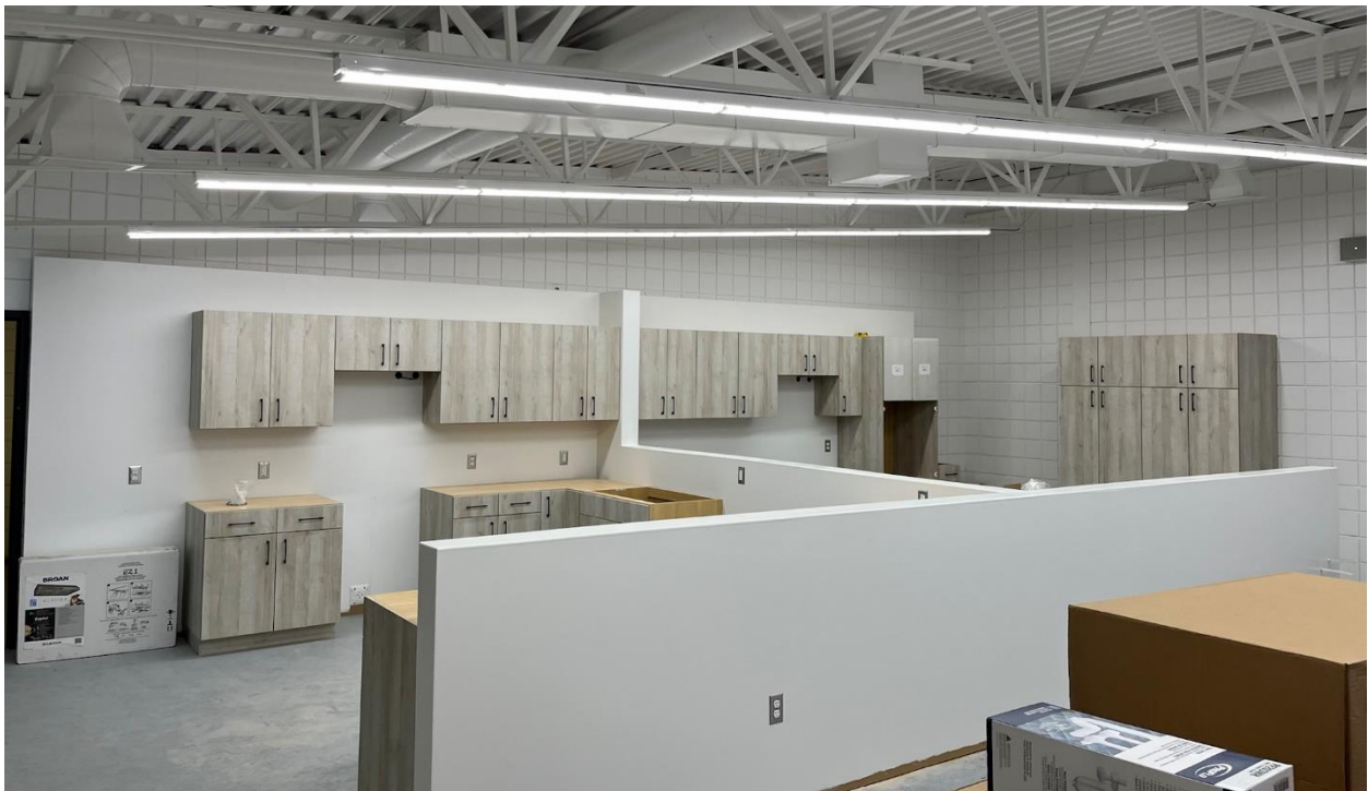
Future Home Ec Space – Under Construction

We are nearing completion a renovation that involves transitioning an existing science lab in the 500 wing into a state of the art Home Economics space. We are currently experiencing issues with supply of building materials; we are expecting to turn the space over by end of February.