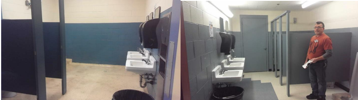
Bathroom pictures before.