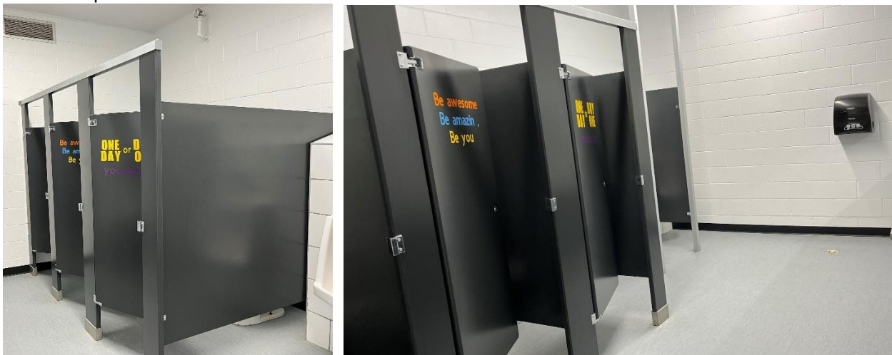
Bathroom pictures after