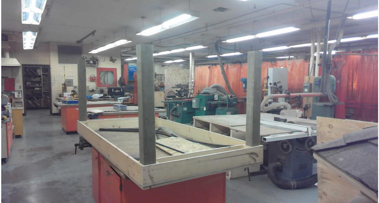
PAA – Classroom – After Renovation