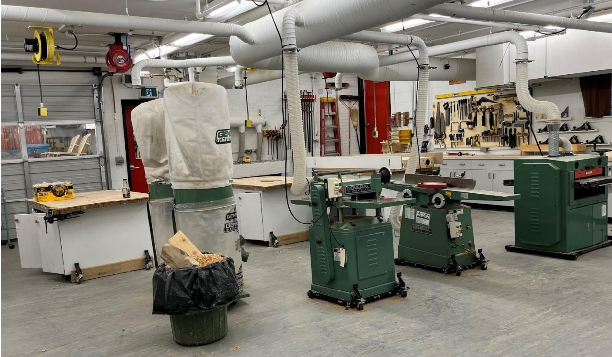
PAA Metals Area – After Renovation