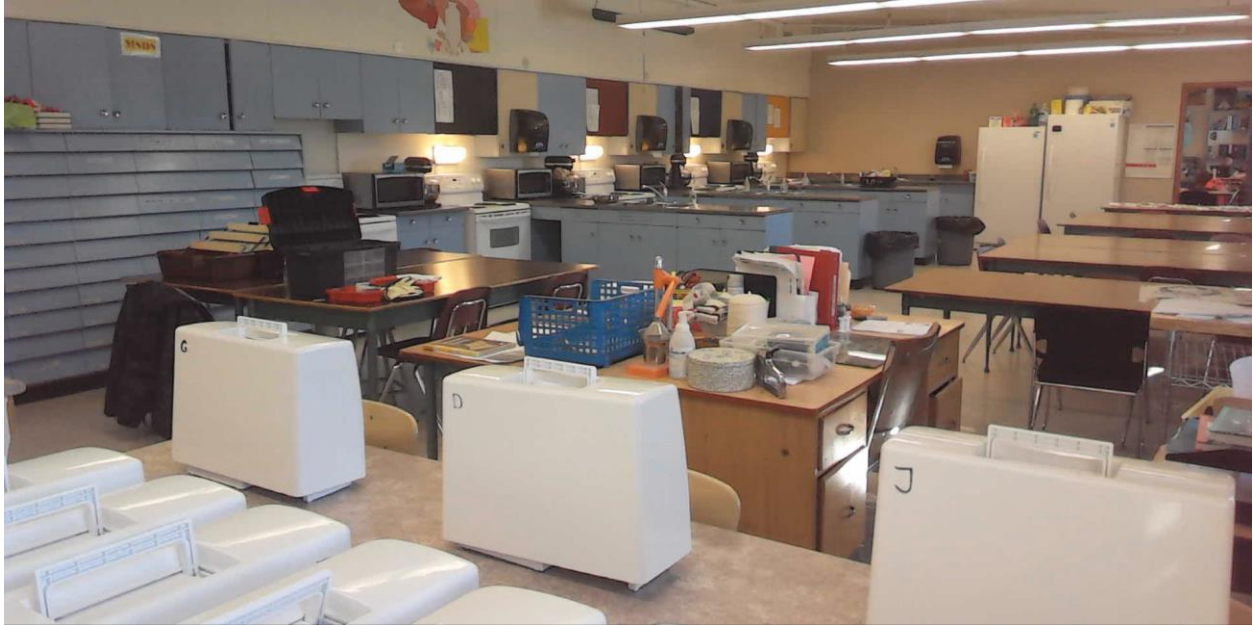
Existing Home Ec Space