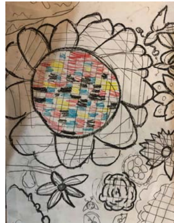
Art Work to the left: Flower