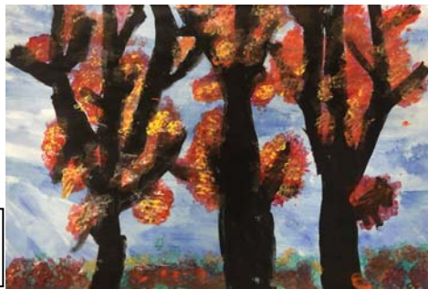
Art Work to the right: Trees