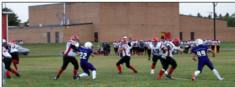
Picture: Esterhazy High vs Melville Comprehensive

Many of the football teams sign joint agreements to allow opportunities for our student athletes. The Esterhazy Warriors are affiliated with Churchbridge and Langenburg schools bringing players from 11 different communities together to play on the team.