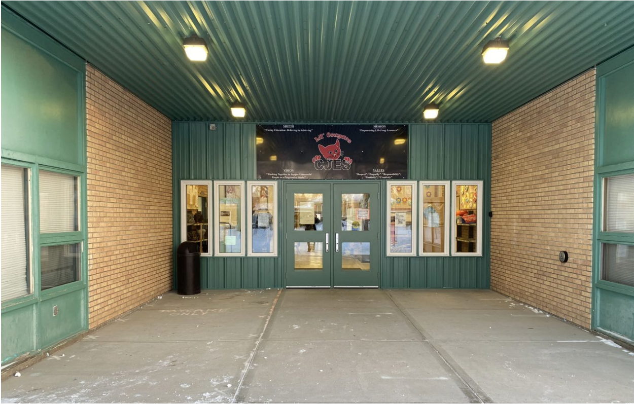
Main Entrance Area: